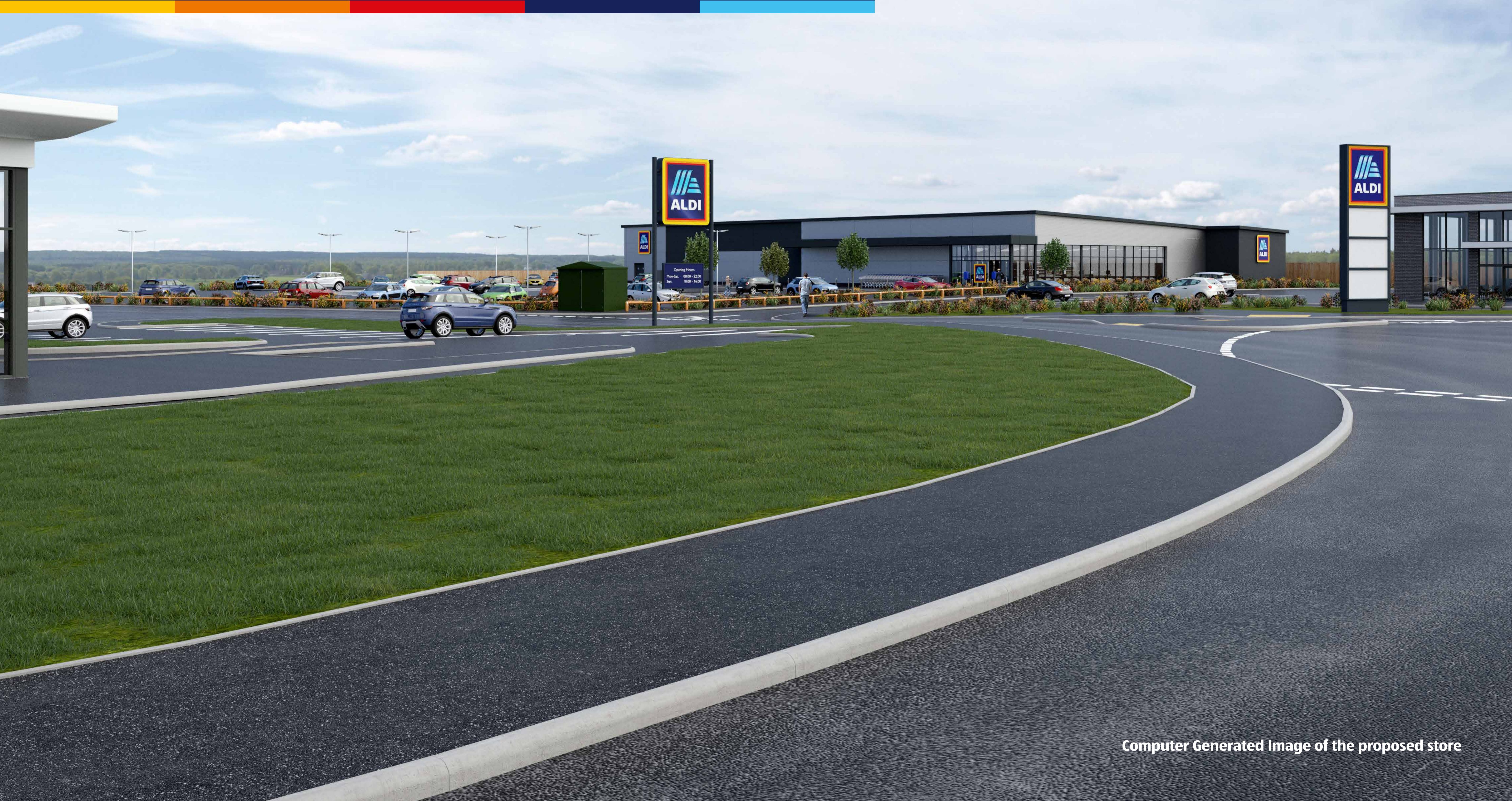
Computer Generated Image of the proposed store