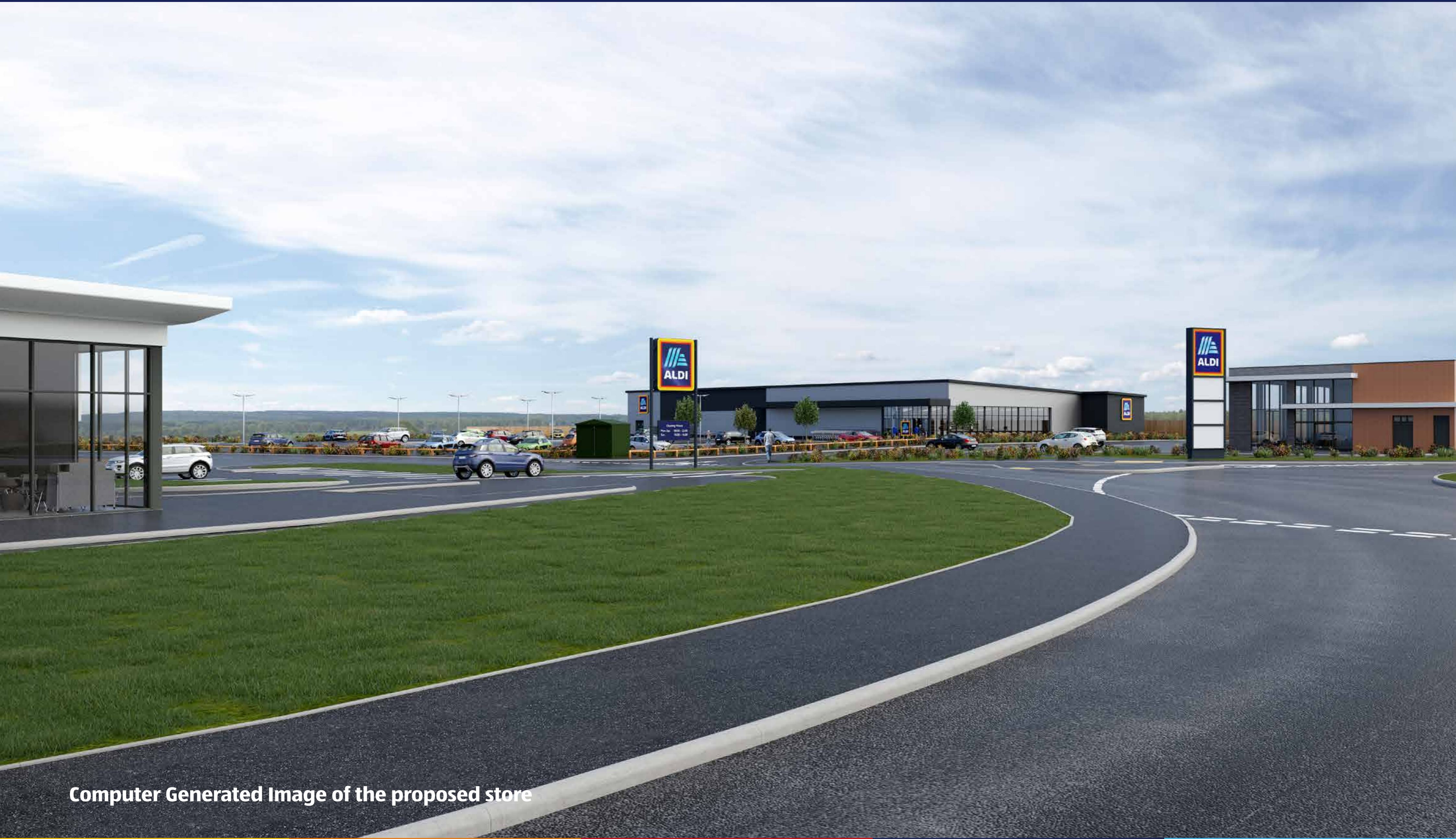
Computer Generated Image of the proposed store