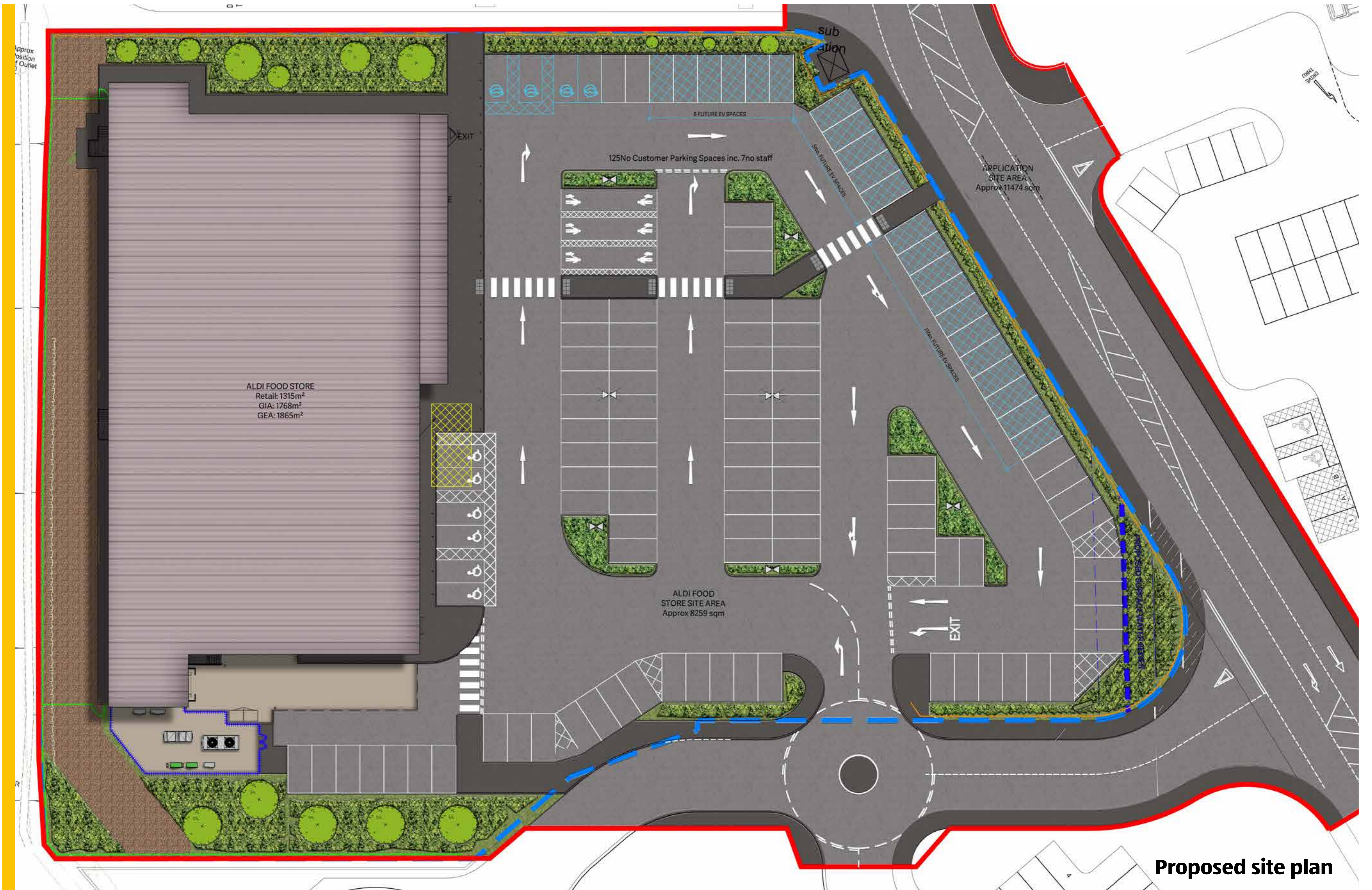
Proposed site plan