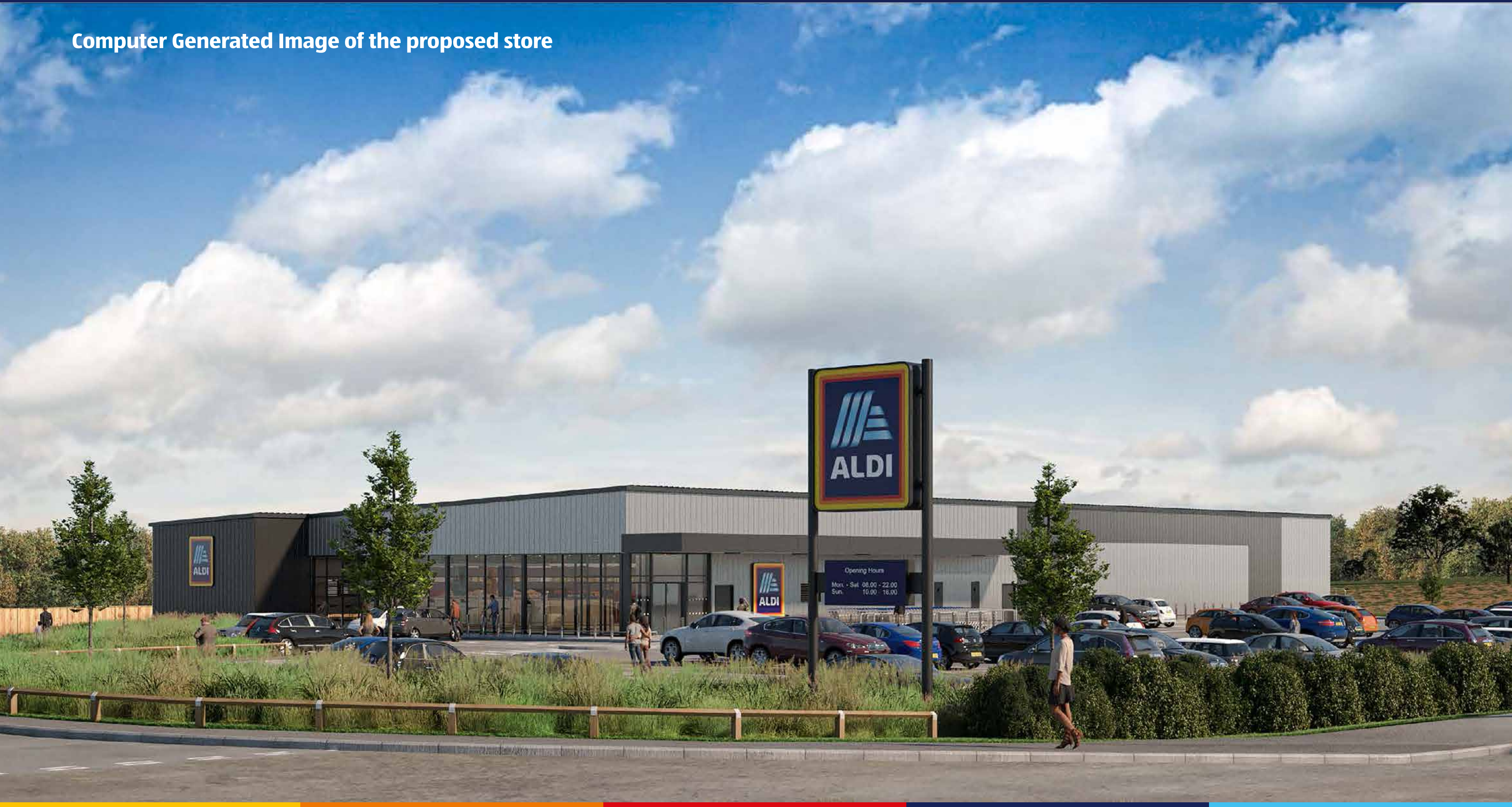
Computer Generated Image of the proposed store