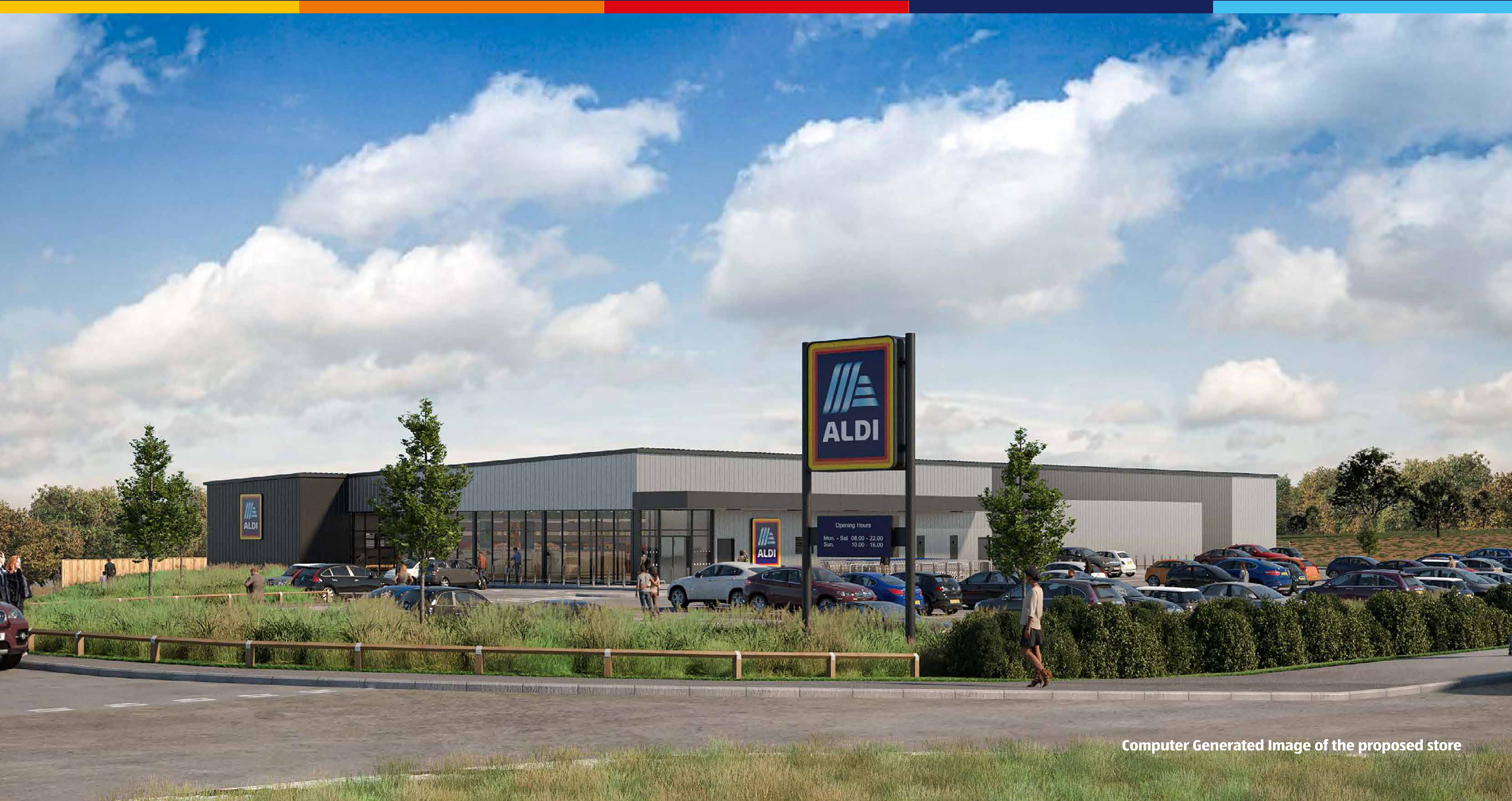
Computer Generated Image of the proposed store