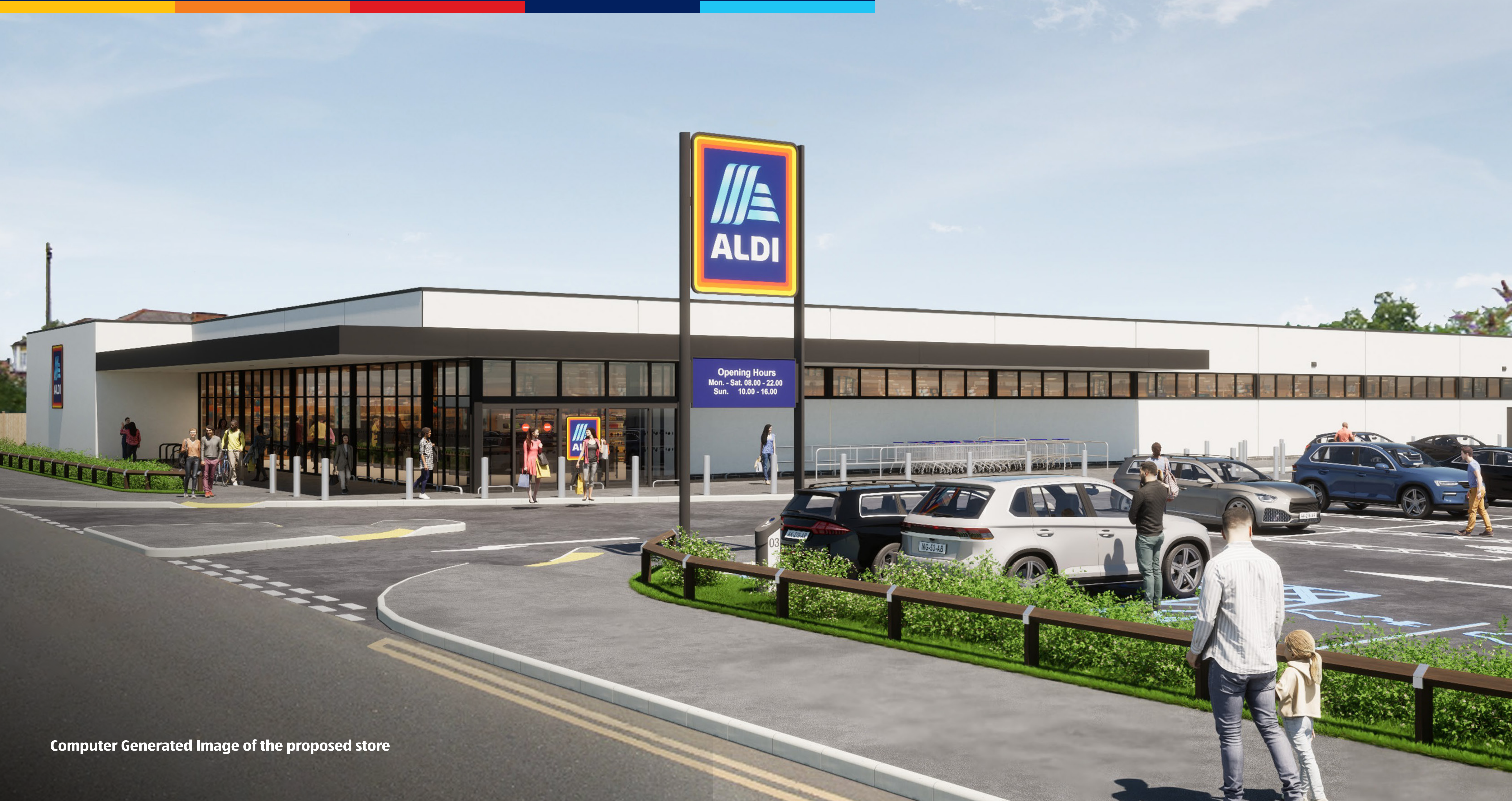
Computer Generated Image of the proposed store