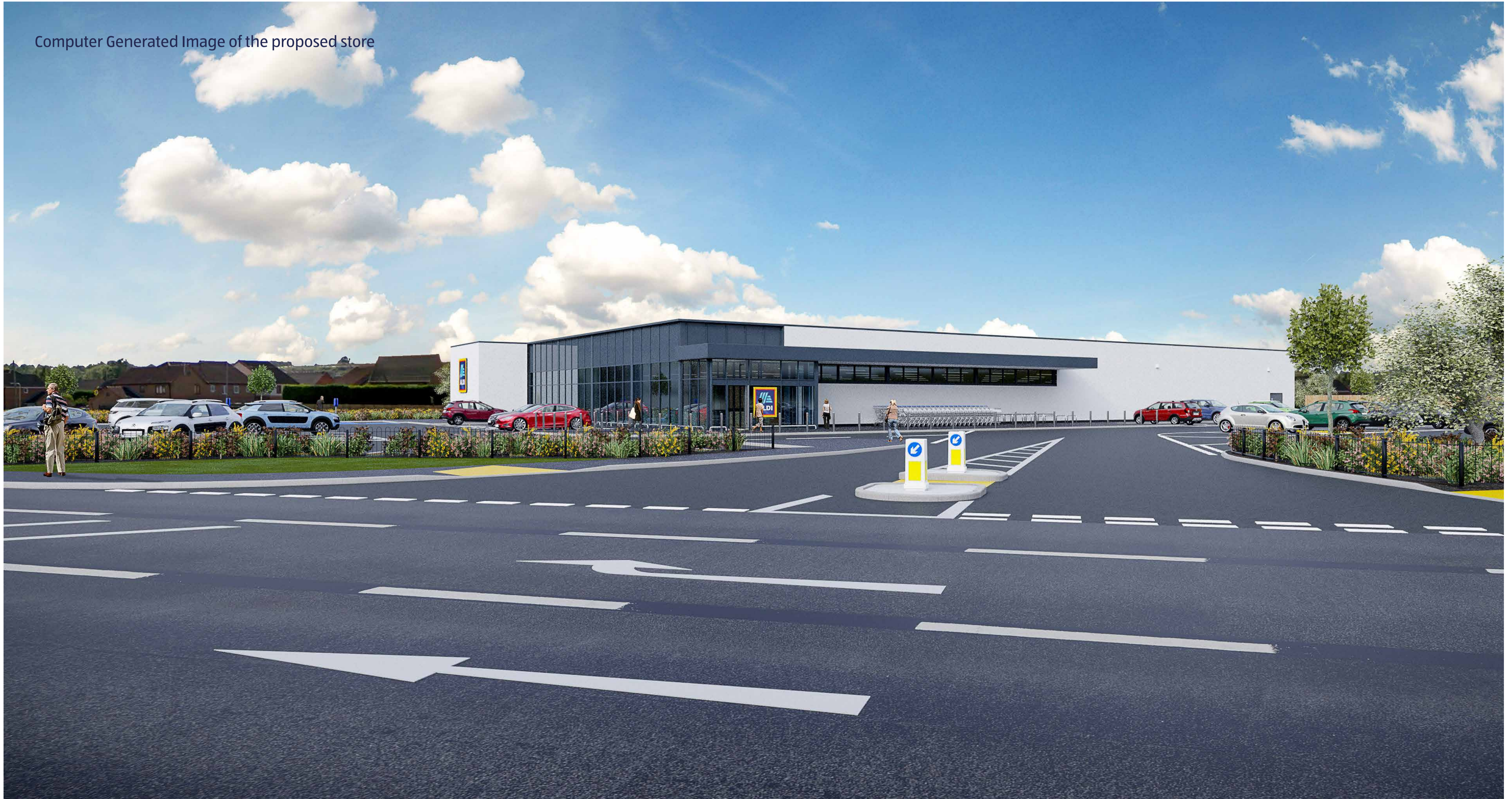
Computer Generated Image of the proposed store