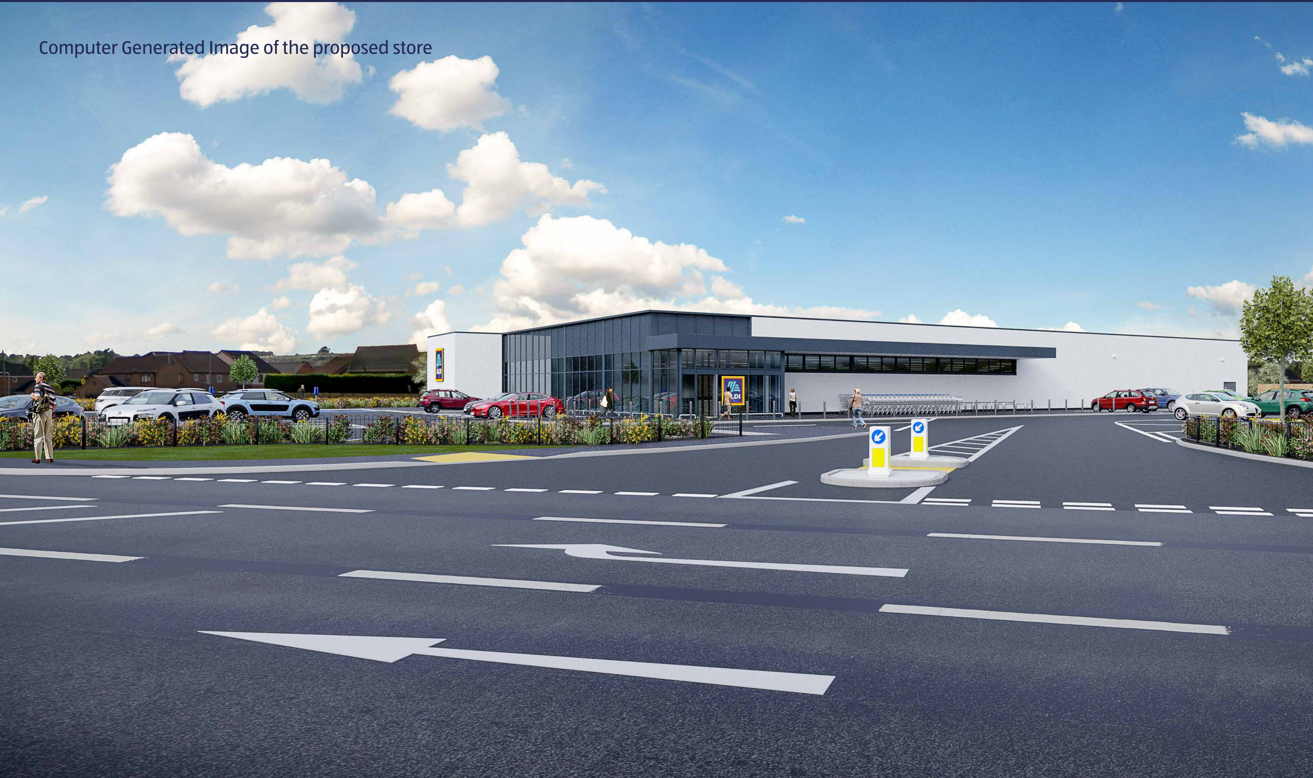
Computer Generated Image of the proposed store