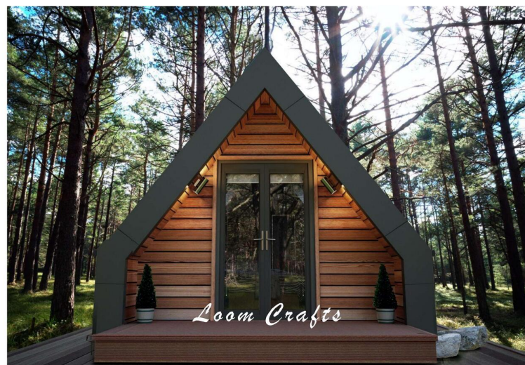
Sample image of typical pre-fab pod