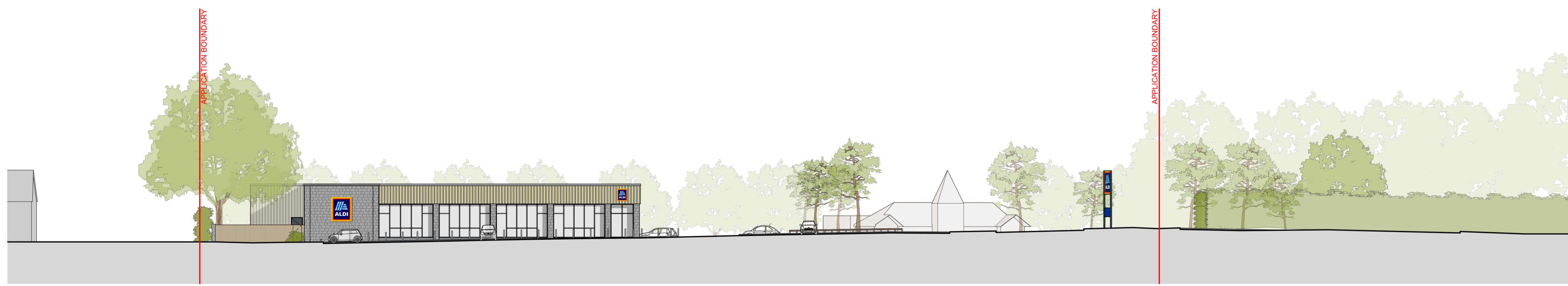
Proposed Section C-C