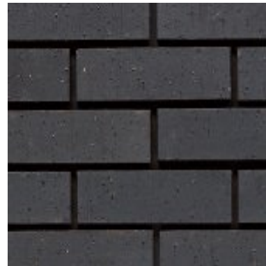
8 Blockleys brick ltd. 'smooth black' with tarmac y14 (black) coloured mortar brickwork to building plinth