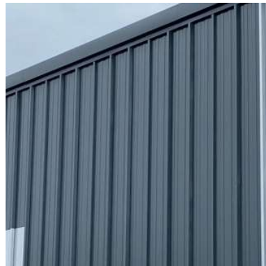
6 Wall - Kingspan KS1000RW anthracite grey cladding RAL 7016