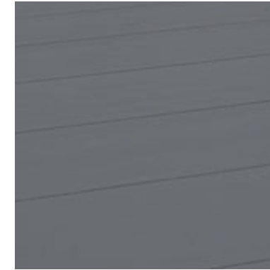
5 Roof - KINGSPAN KS 1000TD (TopDek) COMPOSITE ROOF PANELS. ANTHRACITE GREY RAL 7016