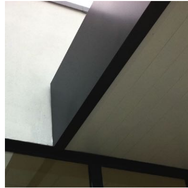
2 Canopy cladding - polyester powder coated aluminium, colour - dark grey ral 7016 (anthracite)