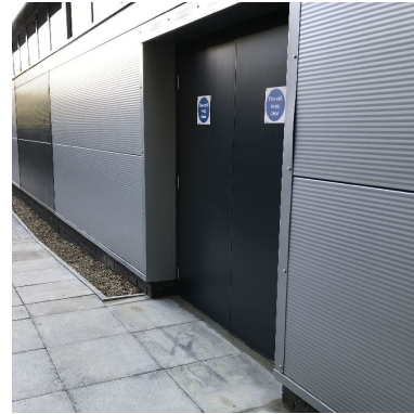
3 External escape doors and frames, steel polyester powder coated finish, colour - dark grey ral 7016 (anthracite)