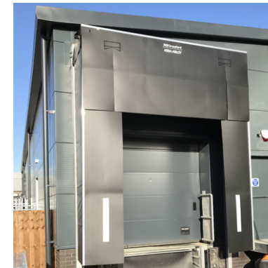
9 Sectional overhead loading bay door - pvf coated steel, ral 7016 (anthracite). Curtain Dock Shelter, colour black