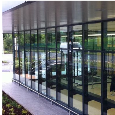
1 Shopfronts / window frames - polyester powder coated aluminium, colour - dark grey ral 7016 (anthracite) by Senior Architectural Systems