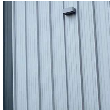
7 Wall - Kingspan KS1000RW metallic silver cladding RAL 9006