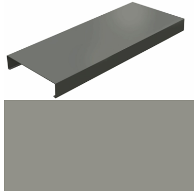
6 Pcc aluminium coping/kick plate - finish colour: ral 7030