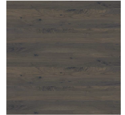
5 Pergola - douglas fir with tekno woodex aqua classic - t840