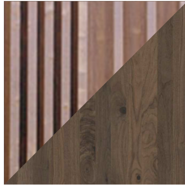
1 Timber cladding - 69mm x 69mm accoya batten on stained 9mm tricoya mdf - high build lacquered finish - tekno woodex aqua classic - t8017