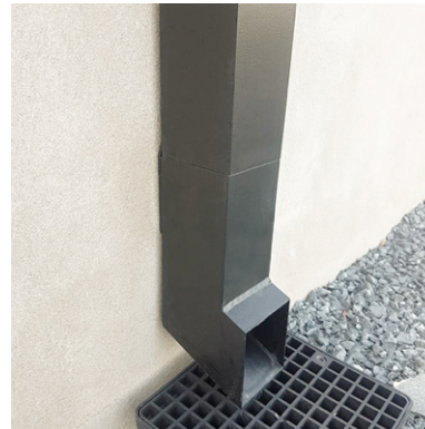
7 Rainwater drainage pipe - finish colour: ral 7030

FOR LOCATION OF MATERIALS SHOWN ABOVE PLEASE REFER TO PROPOSED ELEVATIONS 170466-1405 AND ROOF PLAN 170466-1361