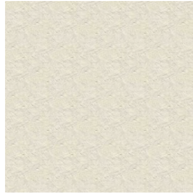
2 Render - k rend silicone tc 15 - ash white