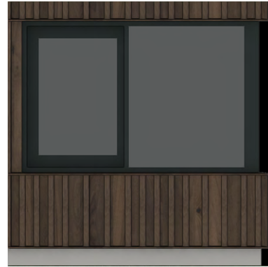
3 Pcc thermally broken aluminium windows frame - colour: ral 9011