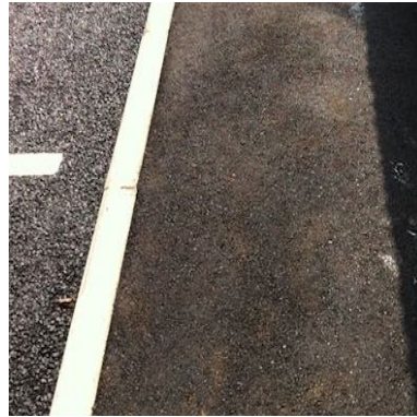
1 Tarmac path with concrete kerb edging - Car park area