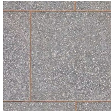
8 Aldi: 450 x 450mm Marshalls consevation paving around store entrance. Smooth finish, colour charcoal