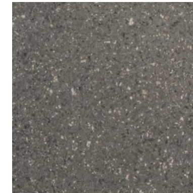
10 Starbucks: Outdoor Paving Tile - 45 degree pattern, Starbucks, Urbex Charcoal - 600x600mm