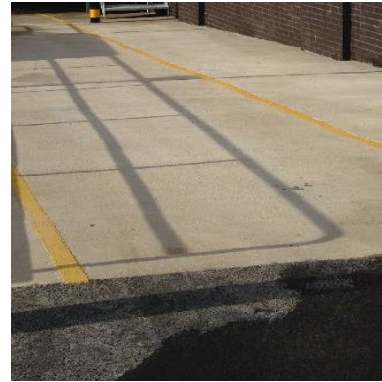
3 Concrete surface to loading bay ramp and Aldi plant slab, brushed finish.