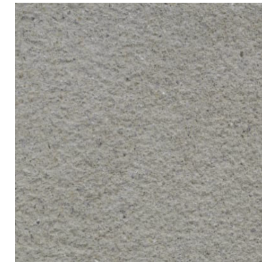
9 Starbucks: Outdoor Paving Tile, Starbucks, Urbex Natural - 600x600mm