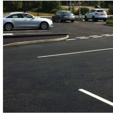
2 Tarmac car park area