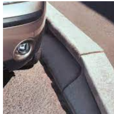
7 Concrete trief kerbs