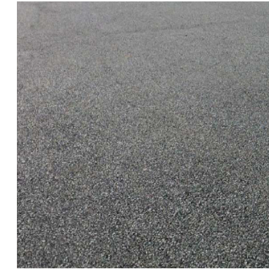
5 Tarmac beneath Aldi canopy to trolley bay