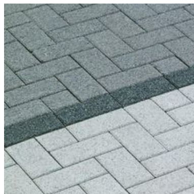
11 Concrete block paving laid in a herringbone pattern to parking bays

FOR LOCATION OF MATERIALS SHOWN ABOVE PLEASE REFER TO PROPOSED SITE PLAN DRAWING NUMBER 170466-1310 & 170466-1320