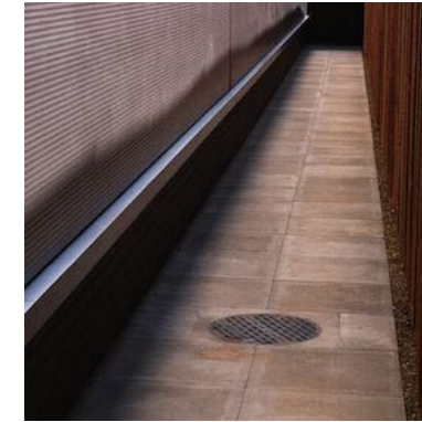
4 600 x 600mm concrete paving slabs to rear of Aldi store for maintenance / escape route. Colour: Grey